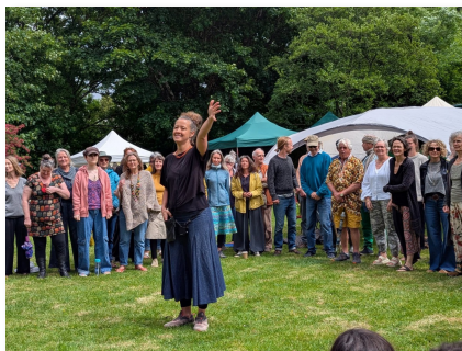
Circle of Song Choir at WoolFest 2025

Over 700 people gathered on Sunday, 25th May at the Orchard Millennium Green in Buckfastleigh for WoolFest – a lively celebration of wool, creativity, and community connection.