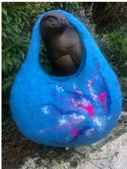
Wet felted bag