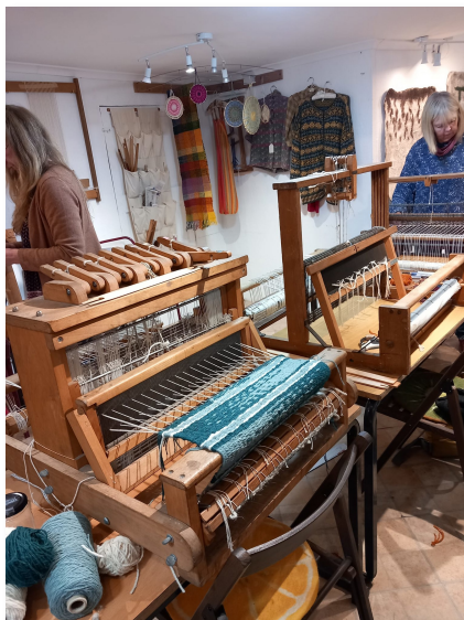
rug making skills

The Wool Hub is your go-to place for woolcraft workshops, regular drop-ins, and a woolly shop, all brought to you by the Woolly Nanas .