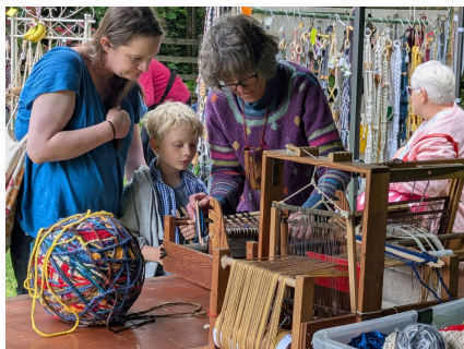
Silkshare at the WoolFest 2025