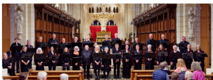
Collati at their concert in Buckfast Abbey in May 2025

The charming town of Ashburton is the setting for an enchanting evening of choral music featuring the Collati Singers . This special event will take place at St Andrew's Church, West Street, TQ13 7JQ on Saturday 12th July at 7:30pm . Delight in an evening filled with beautiful harmonies and no need to fuss over tickets—it's absolutely free !